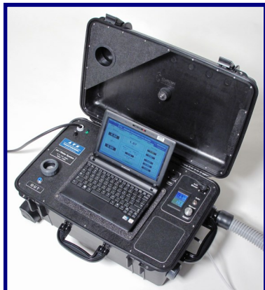
Portable Test Kits Air-Water / Ruggedized / USB