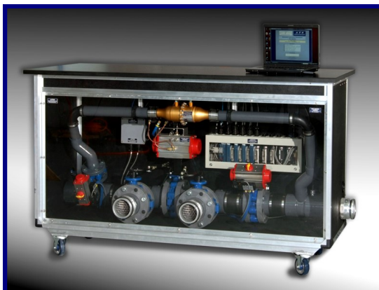
Air-Water-Structural-Cycling Test Console (many options)