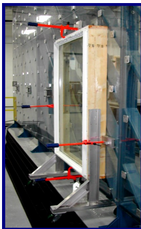
Test Sample Mounted on ATS wall