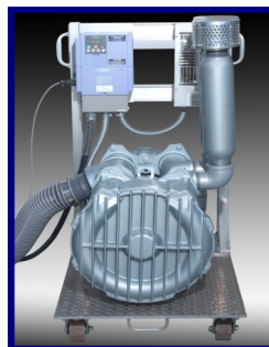
High Capacity Blower Systems