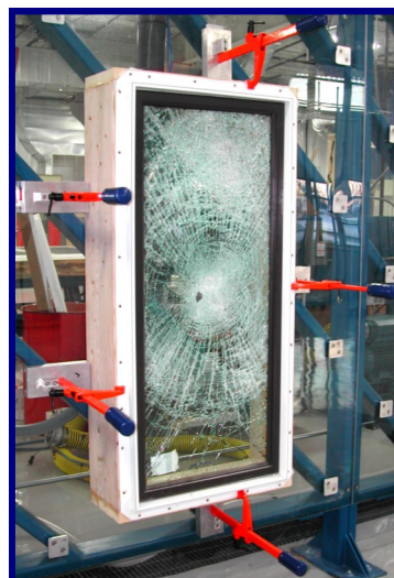
Impacted Window Mounted on an ATS Test Wall and ready for cycling