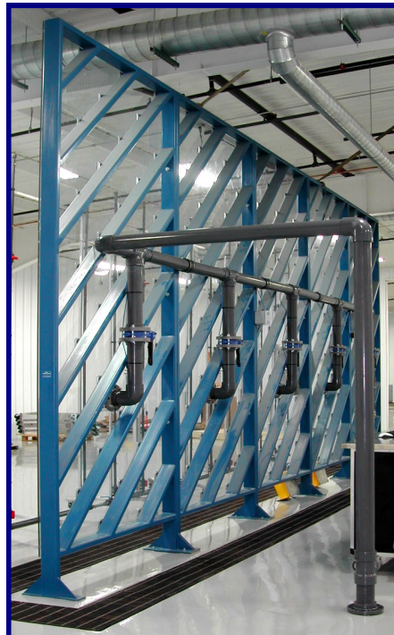
5 Section Test Wall System

Mounted on buck dollies and secured for testing